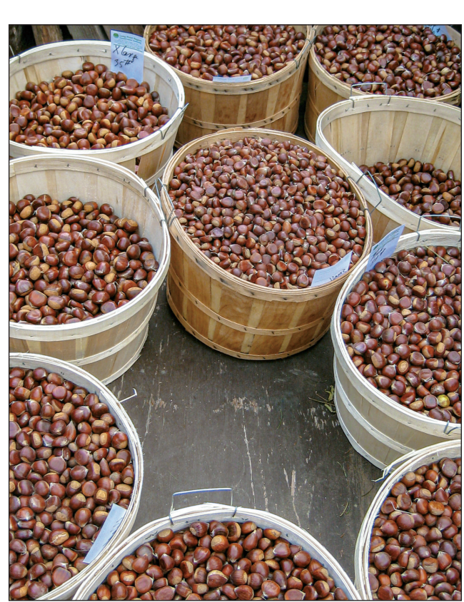
Chestnuts harvested and graded

crop was 1,000 pounds of chestnuts, but this year the weevils, combined with a bad pollination year due to a wet spring, reduced his crop to 100 pounds.