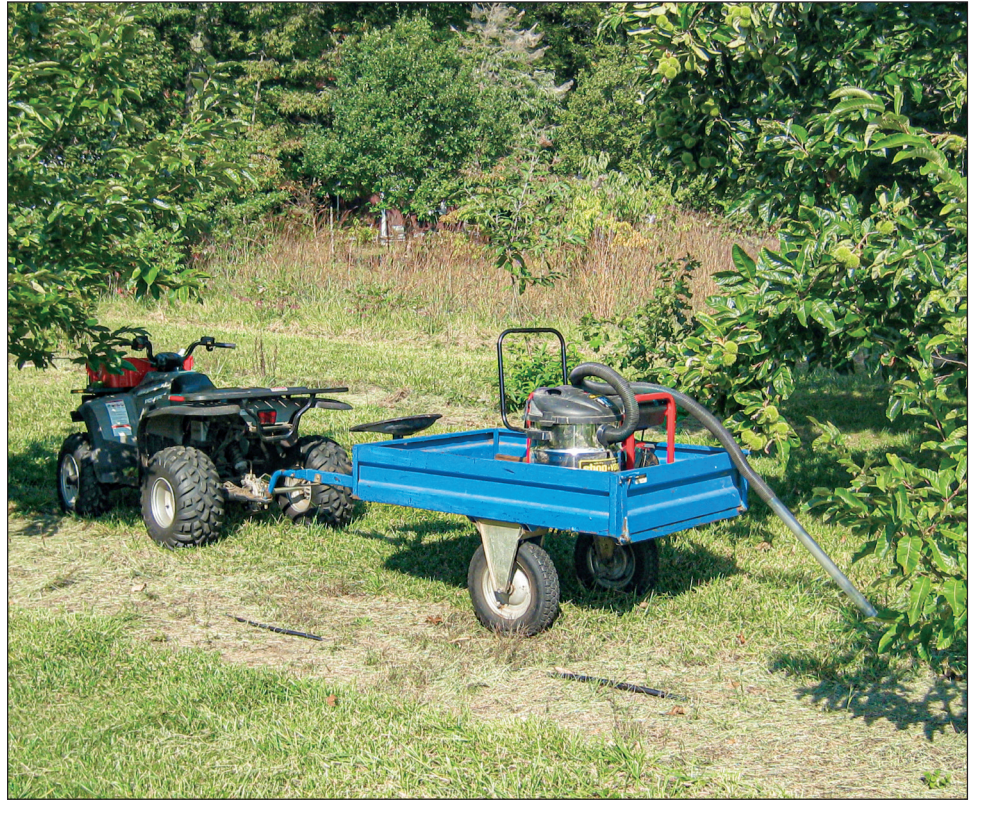
Shop Vac harvesting system

Wynia is not sure where his chestnut crop is going but is still hopeful a larger percentage of the "chestnuts roasting by an open fire" in Ontario can be domestically produced in the future.